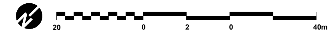
6171 HAZELDEAN ROAD - SITE PLAN